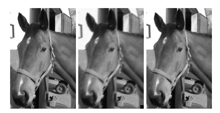
Figure 2: Deblurring and Poisson noise removal by solving (24). From left to right: clean, noisy, and reconstructed image (PSNR: 25.86).